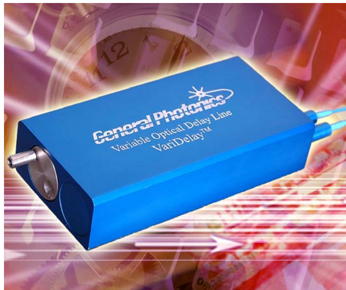
Figure 1. General Photonics' manually variable optical delay line—VariDelay™. In this picture, a manual dial (shining metallic color) is shown at the left end and input/output fibers are at right end of the delay block. The delay length ruler is on the backside and is not shown in the picture.

General Photonics Corp. also has a motorized variable optical delay line, which can be easily controlled with high precision by front panel or computer commands. Please contact General Photonics Corp. for details.